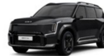
Aurora Black Pearl Earth, GT-line 7 Seat