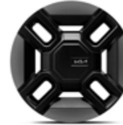
GT-line - 21" Alloy Wheel