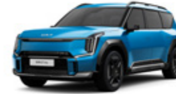
Ocean Blue GT-line 6/7 Seat