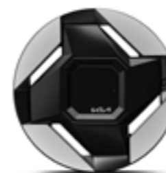
Earth - 19" Alloy Wheel