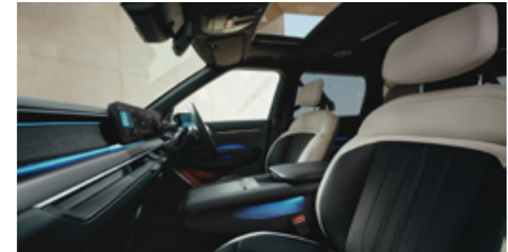
GT-line - Two-tone Vegan Leather