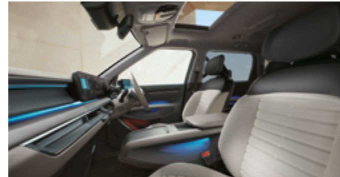
Earth - Two-tone Vegan Leather