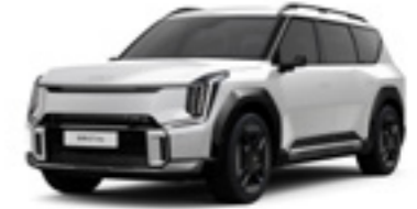
Snow White Pearl Earth, GT-line 7 Seat