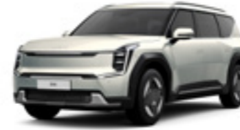
Ivory Silver Earth