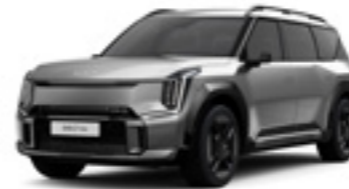
Pebble Grey Earth, GT-line 6/7 Seat